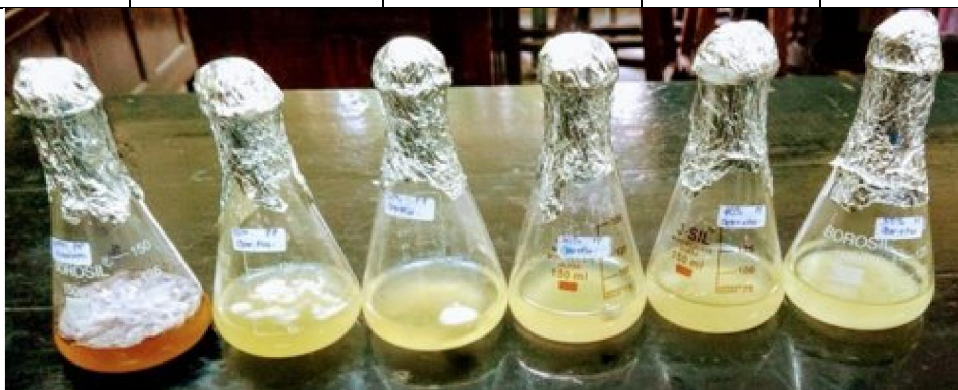
Candida albicans grown in PD Broth + Argemone mexicana aqueous extract