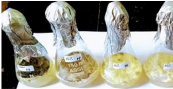
Aspergillus niger grown in PD Broth + Argemone mexicana aqueous extract