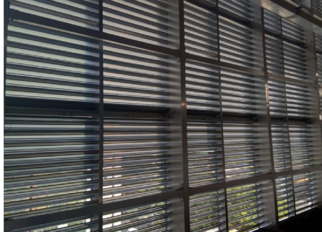
Figure 5: Complete installation of Louvers

Once the installation is completed, the most important aspect is testing the important parameters i.e. water should not come inside the premises and at the same time sufficient air should come from opening area. After completion on site, it is found that 0% water penetration is achieved and at the same time adequate opening area is maintained.