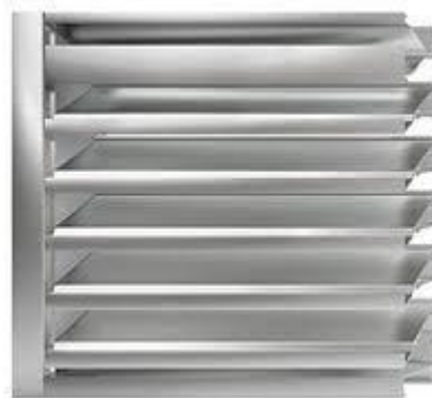
Figure 1: Architectural Louver of Construction Specialties

A louver is a ventilation product that allows air to pass through it while keeping out unwanted elements such as water, dirt, and debris. A few fixed or operable blades mounted in a frame can provide this functionality. The basic considerations for selecting louvers are free area, water penetration and resistance to airflow (pressure loss). Drainable louvers are characterized by gutters incorporated at the front edge of each blade to prevent water droplets from cascading from blade and becoming entrained in the intake air flow. Vertical gutters located in the jamb frames carry the water to the sill frame where it exits from the louver assembly between the sill frame and bottom blade. Drainable louvers generally outperform conventional architectural blade louvers and provide enhanced resistance to water penetration. Vertical gutters located in the jamb frames carry the water to the sill frame where it exits from the louver assembly between the sill frame and bottom blade.