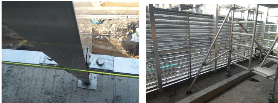
Figure 4: Installation details

Installation of Weather Resistant Louvers comprises of six important components. Those are MS Vertical member, Louver having horizontal and vertical blade, installation of frame, bottom MS shoe bracket and pressure plate. First framing structure is completed by the façade associates in which vertical and horizontal framing structure is completed. Once framing structure gets completed, Louvers are installed with the help of structure.